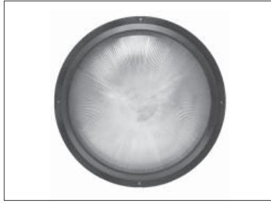
Open with Clear Ribbed Lens